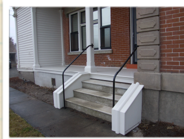
Side porch after restoration work