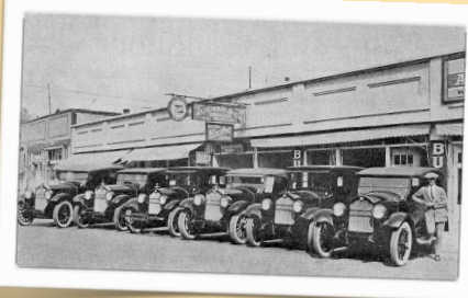
Scott Buick Co., Spokane St. 1923

Beginning July 19, the Kirkman House Museum presents “The Roaring Twenties” - an exhibit that looks at how Walla Walla lived after the “War to End All Wars” and before the Crash of 1929.