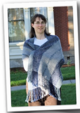
Shawl for drawing

The Kirkman House Museum is pleased to once again host our annual Sheep to Shawl Fall Festival.