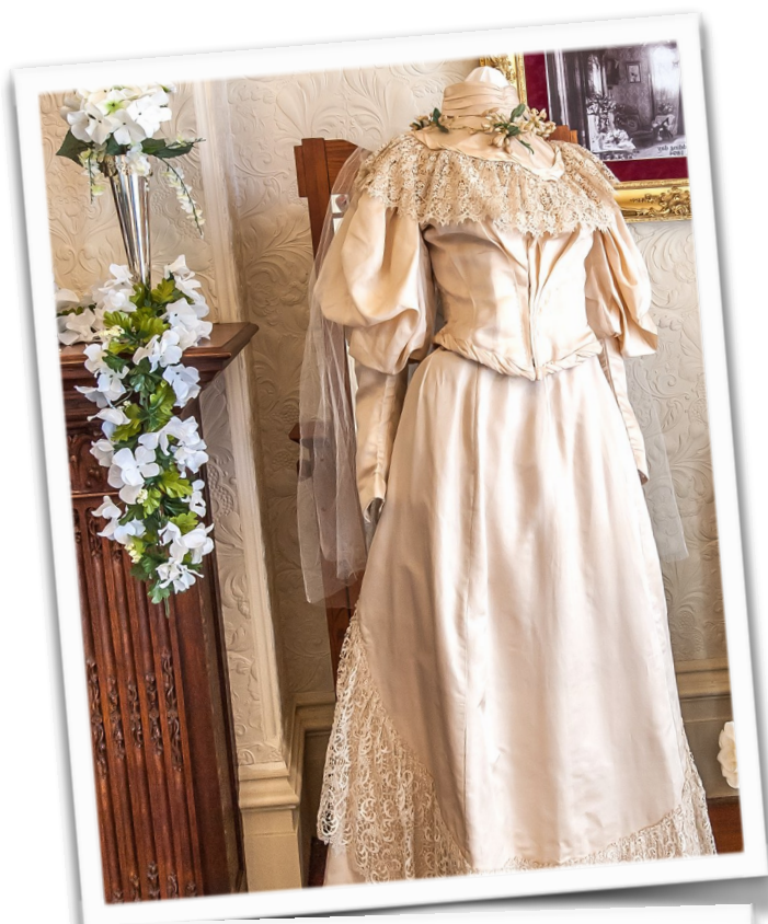
KIRKMAN HOUSE MUSEUM